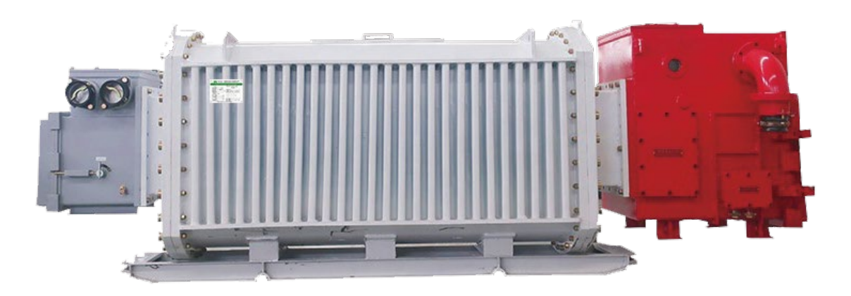
>1000kva KBSGZY Mining Explosion Isolation Transformer

KBSGZY mine flameproof mobile substation is mainly used in methane mixed gas and coal dust and has the danger of explosion in the mine, as a comprehensive mechanized mining equipment of coal mine power distribution device.