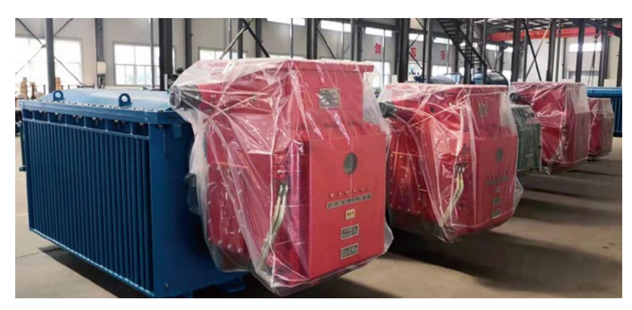
▲ KBSGZY DRY TYPE MINING EXPLOSION ISOLATION MOVEABLE TRANSFORMER SUBSTATION