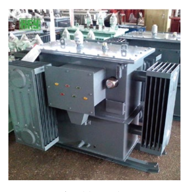
>500kva Mining Transformer