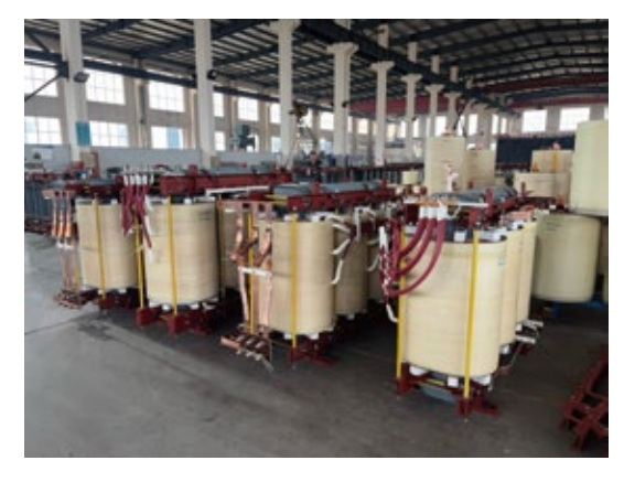
▲ FACTORY DISPLAY

Hengfengyou Electric has 22000 square meters of modern plant, with a monthly delivery capacity of up to 200 Mining Transformer, and has fully passed the ISO9001, ISO14001, SA8000, BSCI and other market access standards reviewed and issued by international certification bodies. At present, the company has 10 senior engineers, 30 senior technicians and more than 300 employees, with an annual output value of US $100 million