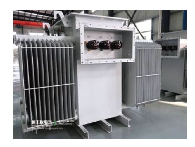
>1000kva Mining Transformer

-The low-voltage side of the transformer allows "Y" type to be connected into 693v or "d" type to be connected into 400V power supply. The secondary end is directly installed in the cable junction box, and six porcelain sleeves are led out for the user to connect the transformer. The lifting lug welded on the box wall is used for the lifting of the transformer. The bottom of the transformer box is equipped with a drag sled. The drag sled is equipped with installation holes to supply ore and add ore car rollers when necessary.